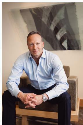
Good for Cover

Cover photos must be in vertical orientation with room at the top for the magazine branding. Extreme closeups are not recommended (see examples). Image must be high-resolution (print quality = 300ppi at 8" x 10").